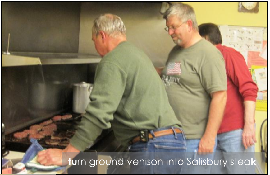
turn ground venison into Salisbury steak

Thank you to Godfellows for a tasty April dinner.